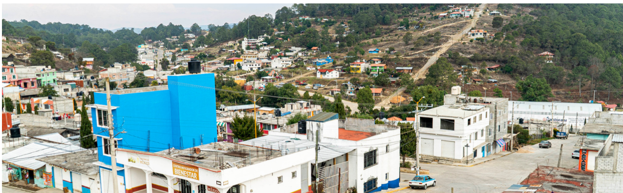
San Miguel el Grande, Mixteca region, Oax.